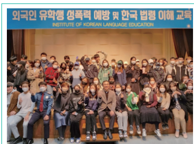
Sexual Violence Prevention Education for International Students