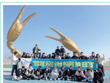
Korean Culture Experience Program