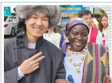
Spring Sports Festival