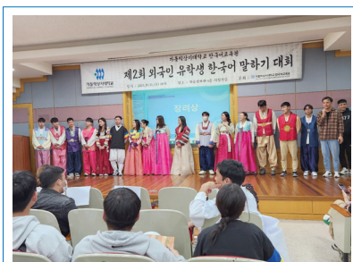
Korean Speaking Contest for International Students