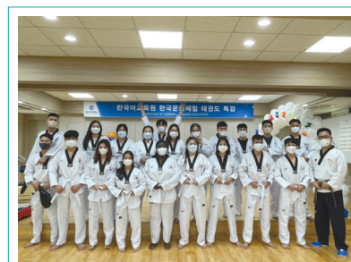
Korean Culture Experience Program

The best specialized university in Korea! Learn Korean culture and join the world