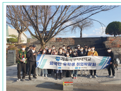
Job Fair for International Students