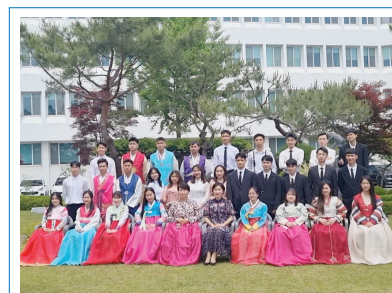
Outdoor Graduation Photo Shoot