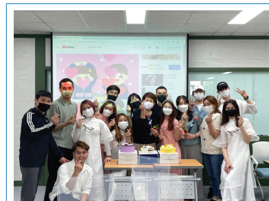
Teacher's Day Event