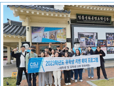
Cultural Experience for Domestic and International Students