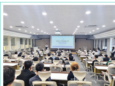
Safety Education for International Students